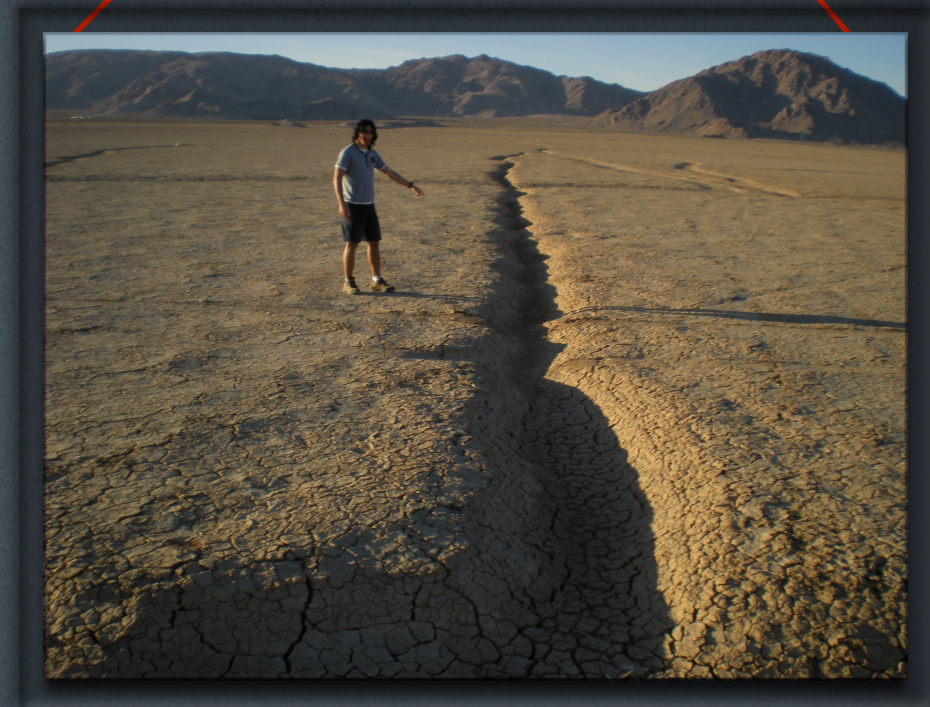
El-Maarry et al., 2014, (Icarus)

The presence of giant mud cracks can be used as an identifying tool of areas that may have harbored lakes _____ Mars.